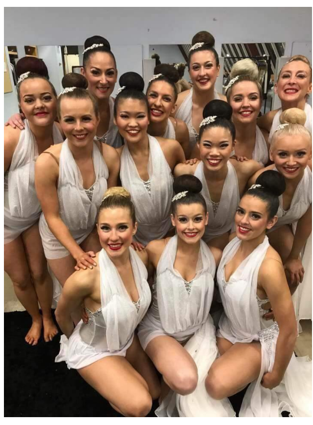
Subbies, Seniors and Subbies again!