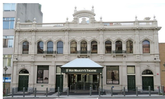
Her Majesty's Theatre