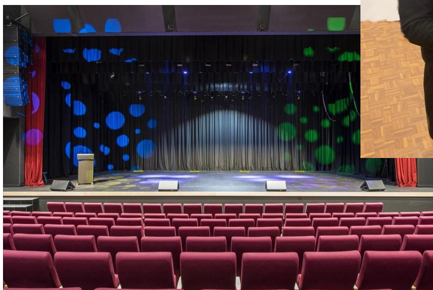
Left: The Kingsway Christian College stage in Perth