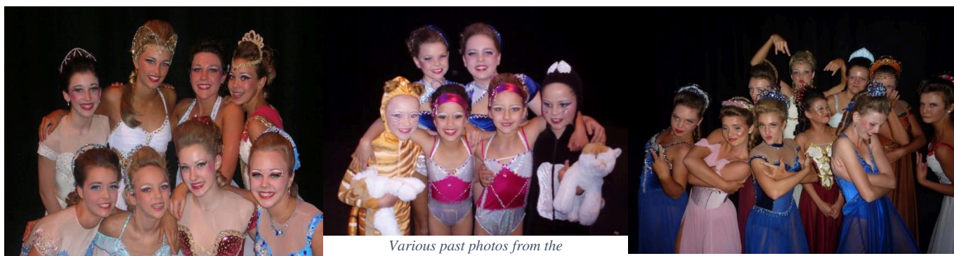
Various past photos from the Karilee Solo Competitions