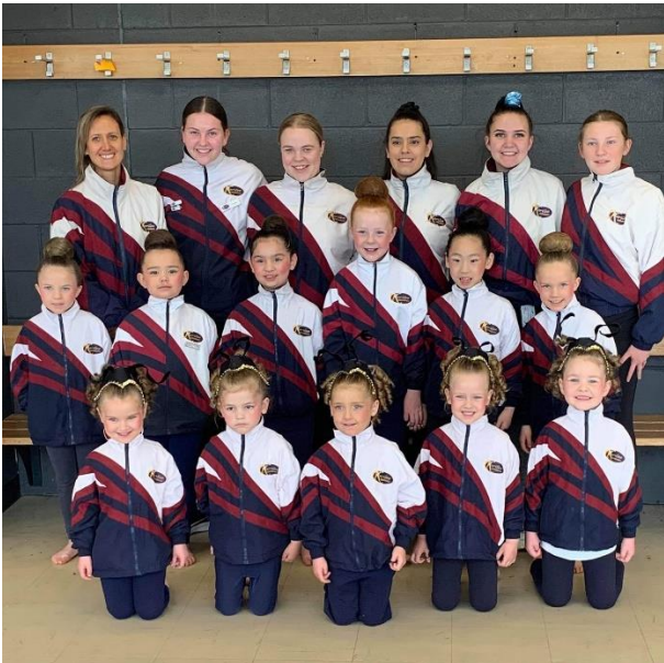
WOW! Our super Subbies were just incredible at the Cali-ACT Restricted Items Competition!

A link has been made available by Cali-ACT for you to watch the competition. So if you want to replay sections of the livestream again, visit sidestage.live/cali . The passwords are the same as originally sent out by your team manager. The competition videos will remain available until the end of the year.