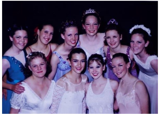
Karilee Solo Competition Can you guess the year?

Looking forward to seeing lots of our members at the 2021 Karilee Solo Competition.